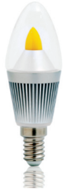
SAN- PIN Light Bulb

ChromaLit Ellipse, Candle and Dome light sources enable brighter, more energy efficient LED bulbs and lighting fixtures by providing wide angle lighting distribution, improved light quality, and greater design freedom. These remote phosphor light sources from Intematix provide highly uniform light distribution and are offered in a variety of lumen levels for applications in indoor and outdoor general lighting, decorative and retrofit light bulb (lamp) designs.